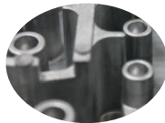
Precise Cavity Processing