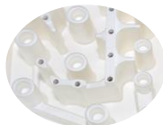
Excellent&100% Silver Plating