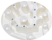
Excellent&100% Silver Plating